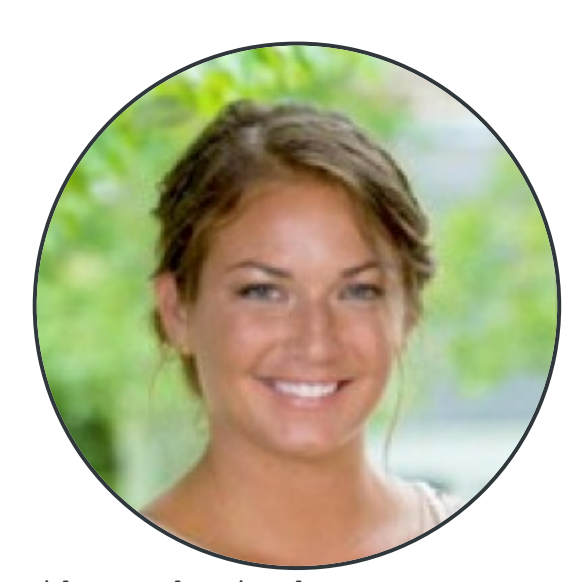
About the Author

Let us know which tip most resonated with you in the comments section below.